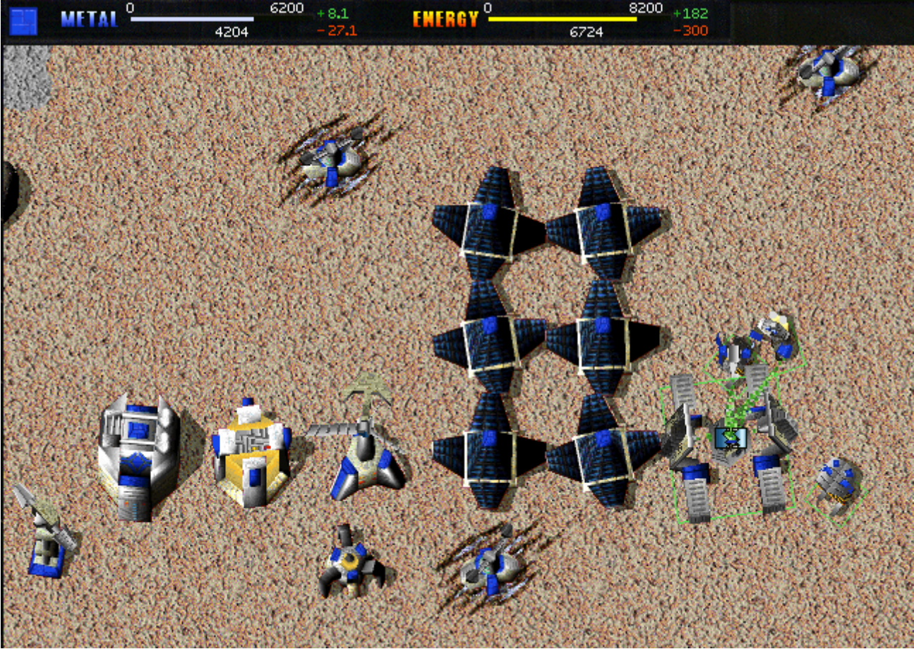
Basic economy buildings from Total Annihilation (from left to right):

Last update: 2020-05-18-02-47 en:games:total_annihilation_mechanics https://mwohlauer.d-n-s.name/wiki/doku.php?id=en:games:total_annihilation_mechanics&rev=1589762872